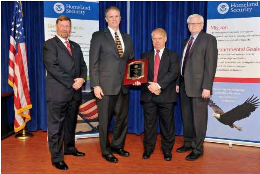
LRS Federal receives Department of Homeland Security's 2011 Small Business Achievement Award

LRS Federal is an engineering, consulting and technical services firm with a reputation for providing performance-based results for complex and challenging projects.